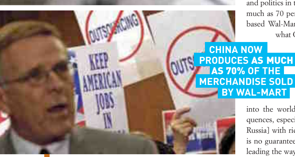
SEN. BYRON DORGAN (D-N.D.) at a protest in Washington, D.C., against the outsourcing of U.S. jobs

If this moment has any parallel in recent history, it is the height of the Cold War, in 1957, when the Soviet Union